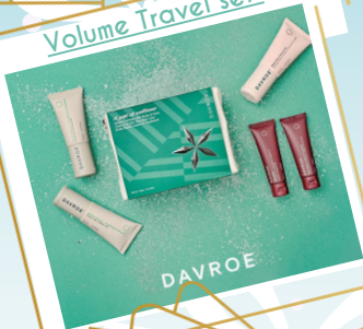
Volume Travel set