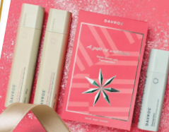
Repair Senses gift set