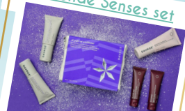
Blonde Senses set