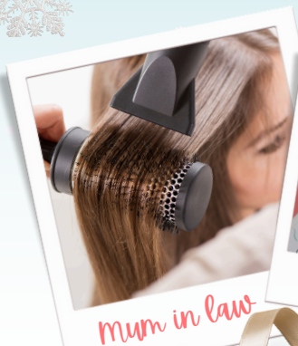
Mum in law

Treat friends and family to the perfect gift - being pampered at THB! Our expert team will wash and dry hair with only the best products, getting that salon finish whenever you want!